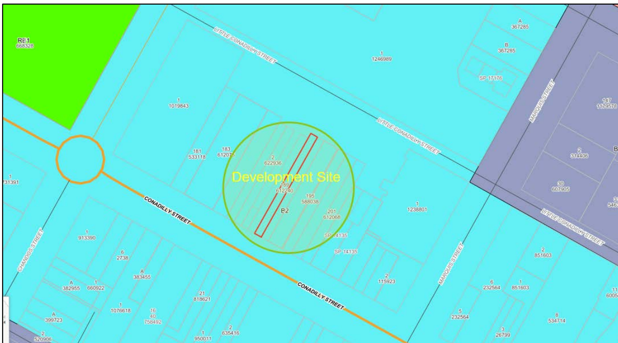
Figure 1 – Site Location

The development application is seeking consent for the enclosure of the existing carport to the rear of the premises and the internal fitout of new food preparation room and freezer room over two stages.