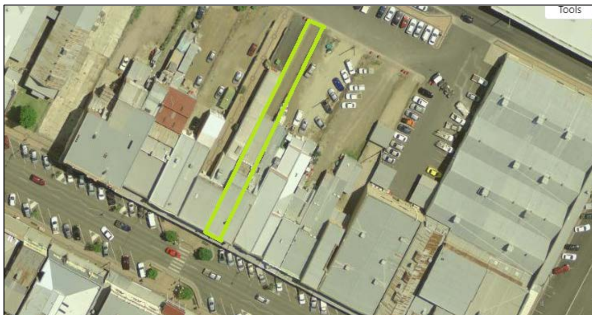
Figure 4 – Koala Development Application Map

The development site does not have a Koala Plan of Management registered against the property. The development site is not identified on the Koala Development Application Map (Figure 4) and the site does not have an area of greater than 1 hectare. Hence, Clause 10 does not prevent the granting of development consent.