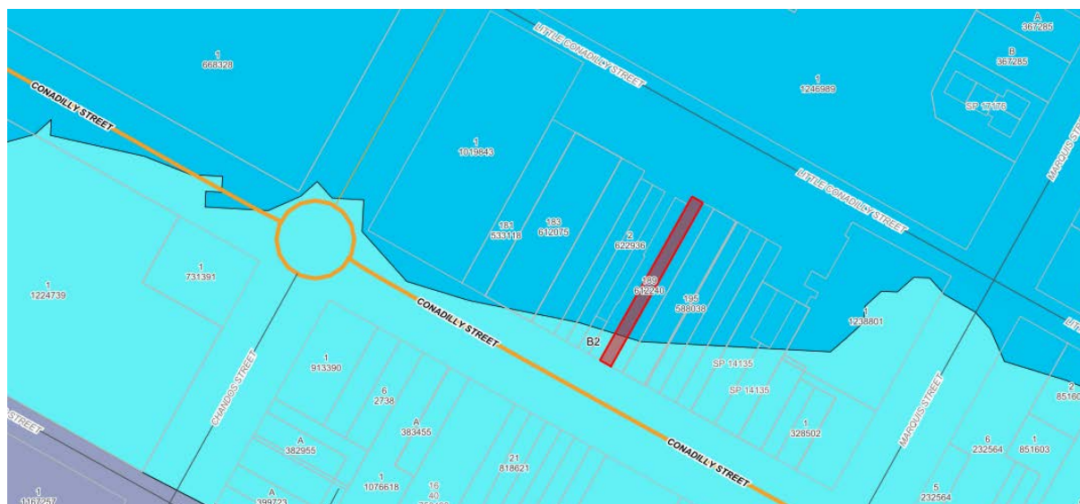
Figure 3 – Site & Rear Elevation Plan

The development site is identified as being partially subject to flooding during a 1 in 100 ARI (Average Recurrent Interval) year flood event, within Council’s LEP, see Figure 3 below. The proposed works will occur to the rear of the existing building which will be located within the flood prone portion of the site. The additions will occur at ground level with floor levels below the flood planning level (1 in 100 ARI level, plus 500mm freeboard). The proposed works are not expected to have any significant adverse affect on flood behaviour and is not expected to increase flooding on adjoining properties or this site. Due to the general low flooding impact on the site and the preparation and implementation of the submitted Flood Response Plan will reduce the risk to life and property. Hence, the development meets the objectives of this clause.