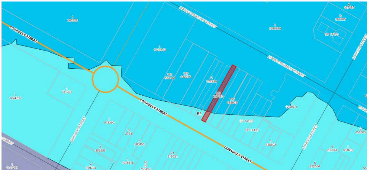
Figure 3 – Site & Rear Elevation Plan