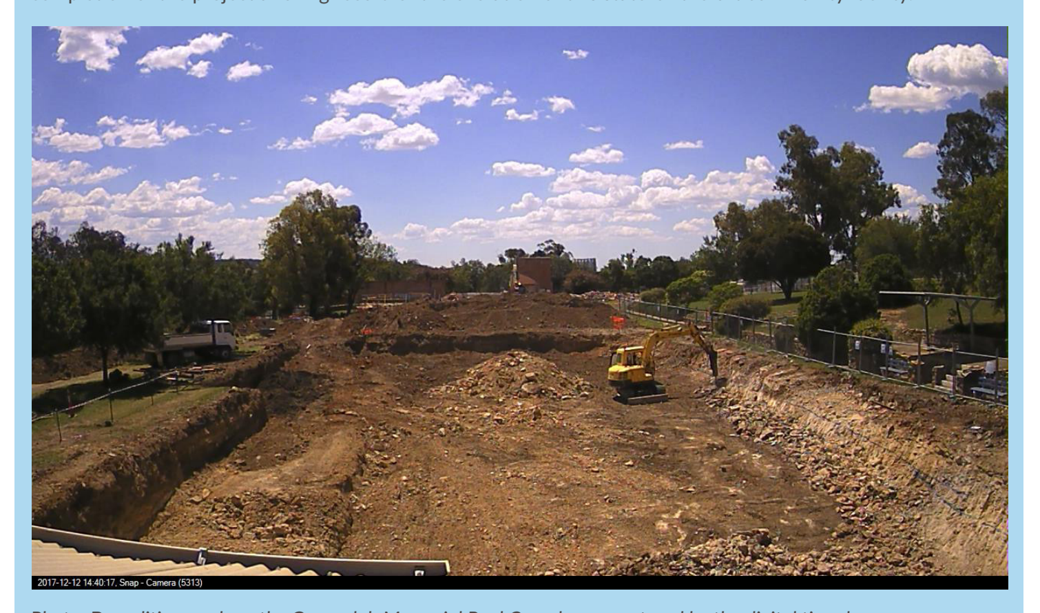
Photo: Demolition work on the Gunnedah Memorial Pool Complex as captured by the digital time-lapse camera.

The construction of the renewed Gunnedah Memorial Pool Complex will be recorded digitally for historical purposes. Much as the grainy pictures of the 1950s provide an insight into the development of the complex, the digital time-lapse camera on the existing Plant Room will provide a daily record of current construction work. Set to record an image every 10 minutes, the camera will provide a daily overview of work on the facility and at the completion of the project a rolling record of the evolution of this state-of-the-art community facility.