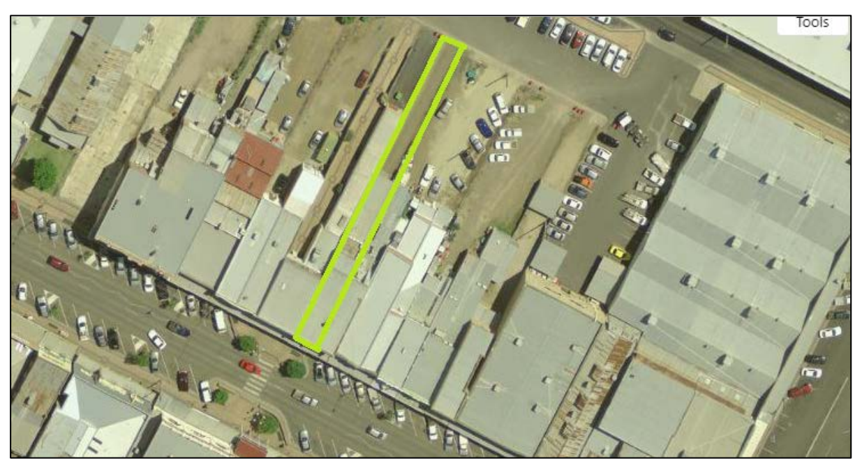
Figure 4 - Koala Development Application Map

The development site does not have a Koala Plan of Management registered against the property. The development site is not identified on the Koala Development Application Map (Figure 4) and the site does not have an area of greater than 1 hectare. Hence, Clause 10 does not prevent the granting of development consent.