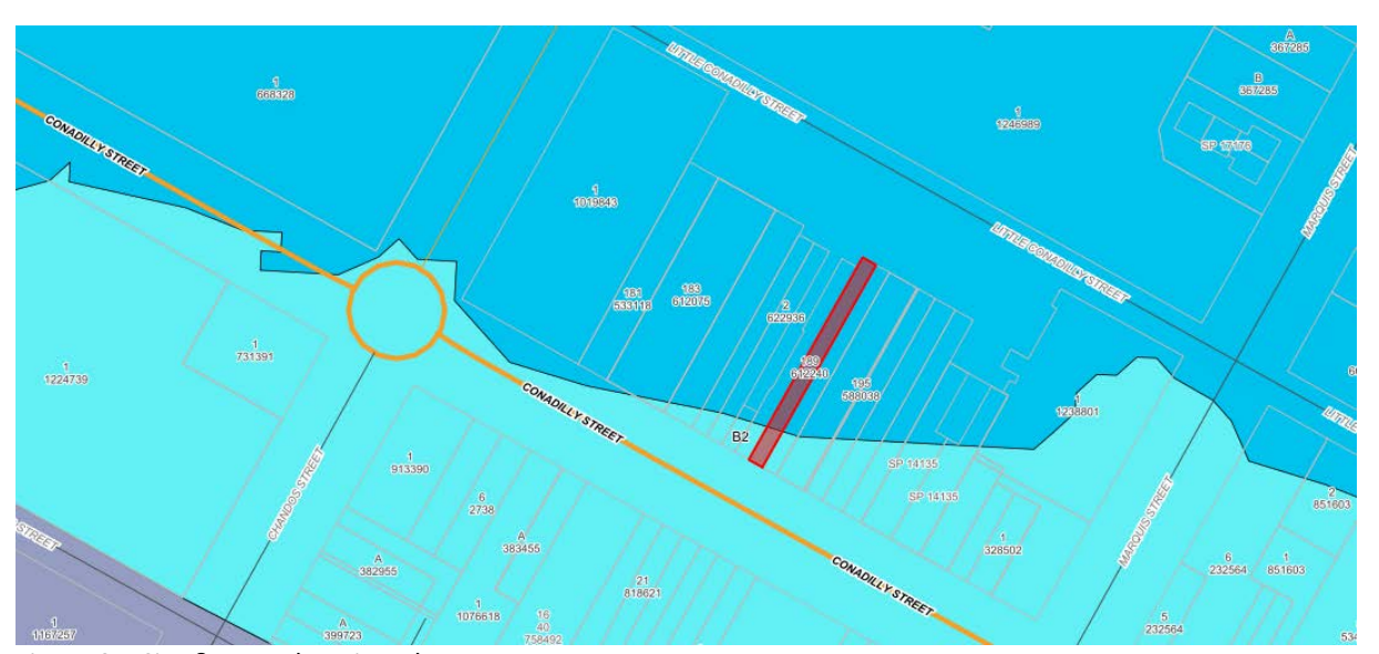
Figure 3 – Site & Rear Elevation Plan

The development site is identified as being partially subject to flooding during a 1 in 100 ARI (Average Recurrent Interval) year flood event, within Council's LEP, see Figure 3 below. The proposed works will occur to the rear of the existing building which will be located within the flood prone portion of the site. The additions will occur at ground level with floor levels below the flood planning level (1 in 100 ARI level, plus 500mm freeboard). The proposed works are not expected to have any significant adverse affect on flood behaviour and is not expected to increase flooding on adjoining properties or this site. Due to the general low flooding impact on the site and the preparation and implementation of the submitted Flood Response Plan will reduce the risk to life and property. Hence, the development meets the objectives of this clause.