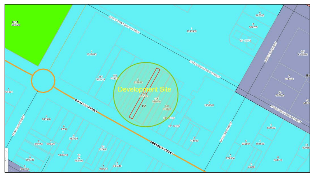
Figure 1 - Site Location

The development application is seeking consent for the enclosure of the existing carport to the rear of the premises and the internal fitout of new food preparation room and freezer room over two stages.