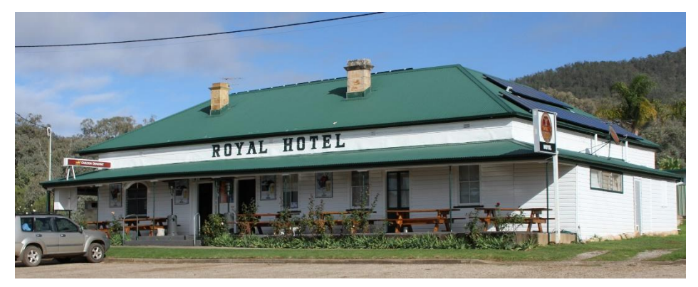
Royal Hotel, Tambar Springs

Gunnedah Shire has 32 commercial accommodation properties including 10 motels (213 rooms), 9 serviced apartment properties, 9 pub hotels, 3 caravan parks and a B&B. Gunnedah also runs a very popular home hosting program during Agquip. Gunnedah has a range of conference and meeting facilities, with the town's infrastructure ideally suited to conferences of up to 300 delegates.