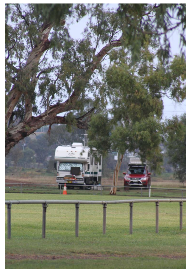
The Namoi River corridor is a popular camping site for the touring caravan and RV markets

Growing visitation to the Shire will bring 'new' dollars into the local economy with these 'new' dollars having a multiplier effect, filtering through to most sectors. This will contribute to increasing the long term viability of local businesses and generate and sustain employment. Research undertaken by Tourism Research Australia in conjunction with the Australian Bureau of Statistics has found that the value created by tourism expenditure exceeds that of other major economic activities, with every dollar spent by the tourism sector generating an additional $0.90 in value-add. In contrast the value-add spend for retail is $0.70, mining is $0.60 and health care and social assistance is $0.50.