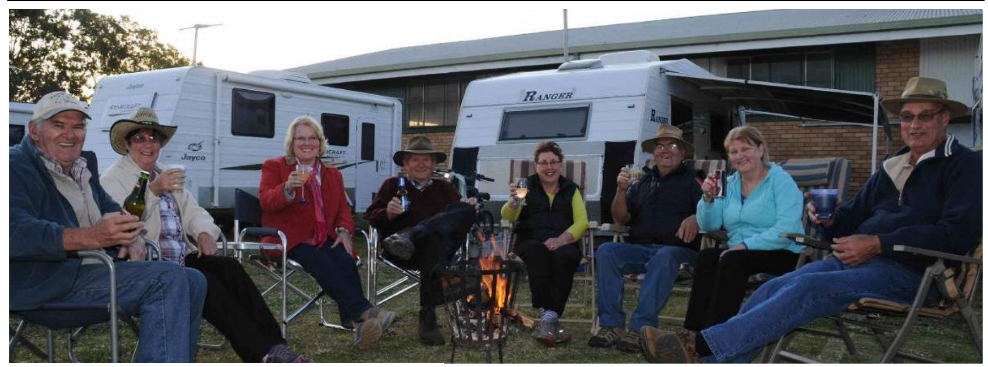
Campers, Gunnedah Showground