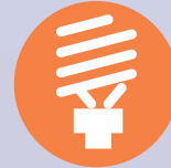
Fluoro globes and tubes