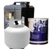
Gas bottles, paint or oil