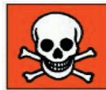
Hazardous or chemical waste