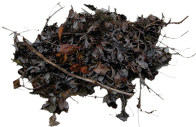
Dry leaves & prunings