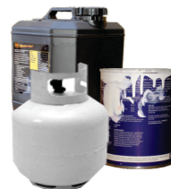
Gas bottles, paint, batteries or oil