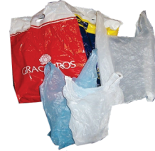
Plastic bags & wrappers