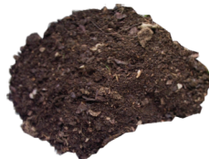
Rocks or soil