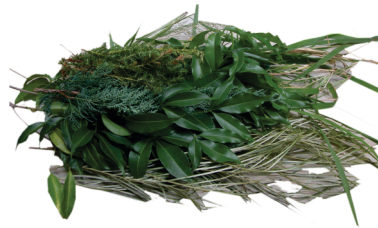
Fresh leaves & prunings