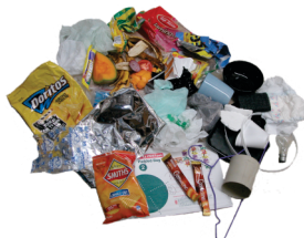
Food or garbage