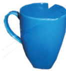
Ceramics & crockery