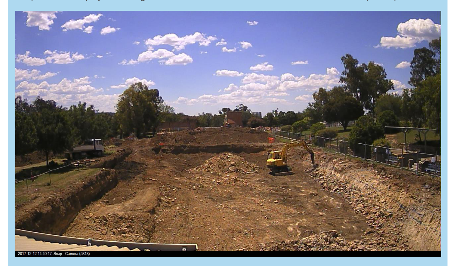
Photo: Demolition work on the Gunnedah Memorial Pool Complex as captured by the digital time-lapse camera.

The construction of the renewed Gunnedah Memorial Pool Complex will be recorded digitally for historical purposes. Much as the grainy pictures of the 1950s provide an insight into the development of the complex, the digital time-lapse camera on the existing Plant Room will provide a daily record of current construction work. Set to record an image every 10 minutes, the camera will provide a daily overview of work on the facility and at the completion of the project a rolling record of the evolution of this state-of-the-art community facility.